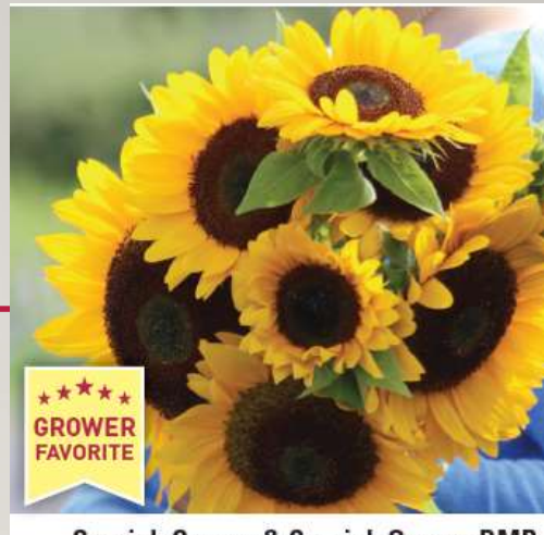
Sunrich Orange & Sunrich Orange DMR