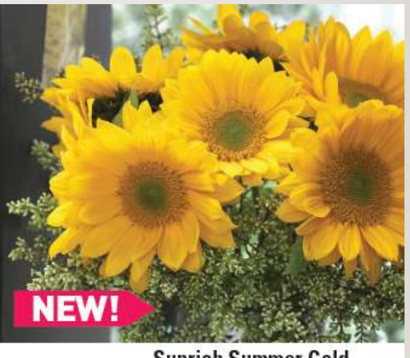
Sunrich Summer Gold