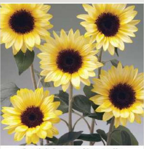
Sunrich Summer Limoncello